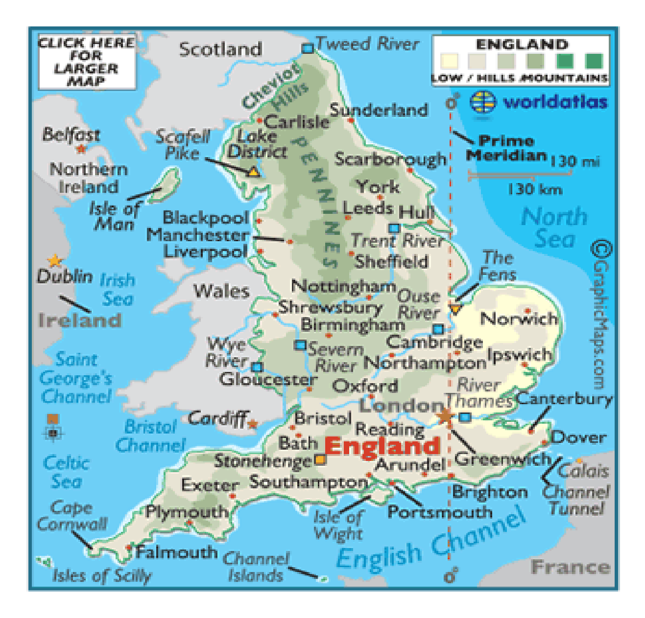
FIGURE 1: MAP OF ENGLISH CHANNEL